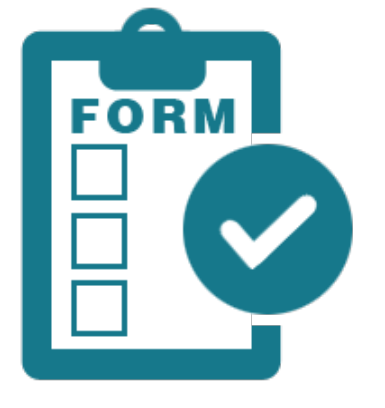
Member of Mercy Team then contacts that person completes the intake form.