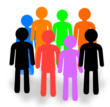
Mercy Team then contacts that person to get more information.