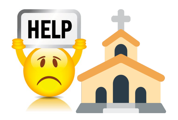
Someone comes to the church or a church member with a need.