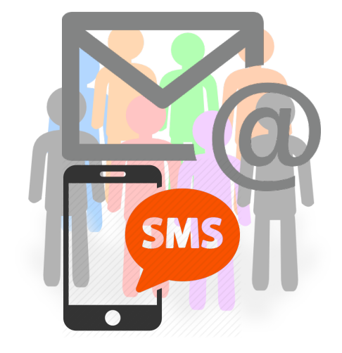
Member of Mercy Team then shares need with team.